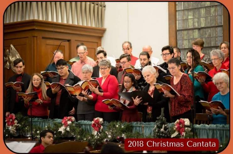
2018 Christmas Cantata

REHEARSALS begin Saturday, 9/30 @ 10:00 AM.