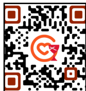
Givelify (Can designate giving)