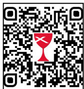
PayPal (General Fund only)

(download one or both at the Google Play Store or the Apple Store)